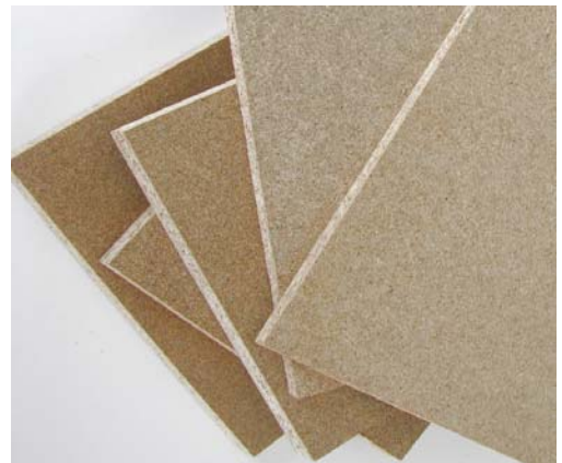
Composite wood panels include particleboard, MDF, and plywood. Differences in characteris-

Gypsum-board (sheet rock), plaster, and similar materials are not suitable due to low internal bond and differences in dimensional change.